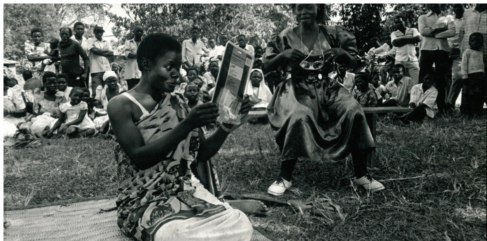
A picture of the first HIV positive drama group using their platform to dramatise the scourge.