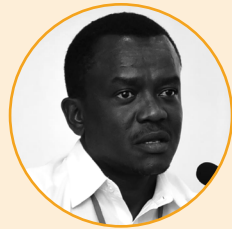
Paul Bitarabeho Africa Resource Center