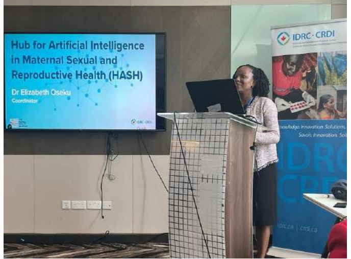
The HASH project coordinator at the AI for Global Health Meeting 2023 in Nairobi