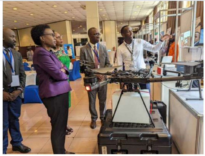
The Minister of Health Dr Ruth Aceng inspects the medical drones at Digital Health Conference