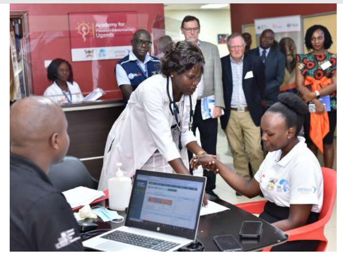
The Academy staff take guests through a role play at the IDI at 20 celebrations