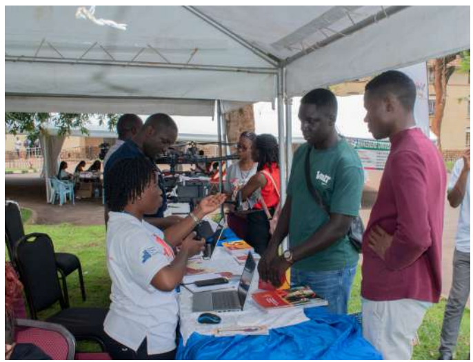
Students interact with the Academy tent at the Youth & Innovation Expo held at Makerere University